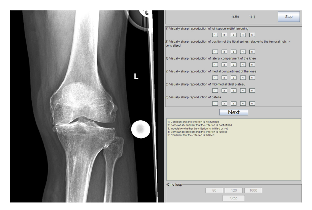
Figure 1. Screenshot of ViewDex 2.0.

Consequently, if the projection used is an AP extended projection, the cartilage space would still appear normal since most of the anterior cartilage is still well maintained. Although it should also be noted that increased flexion alone can result in apparent joint space loss of up to 25% in the medial compartment<sup>5</sup> indicating that there is still disparity regarding the optimal knee flexion angle.<sup>6</sup> That said, the sensitivity to detect narrowing of the joint space when using the fixed flexion PA is only slightly better when compared to the standard standing AP.<sup>1</sup> Therefore, the different projections would fulfil different criteria especially if looking for a range of pathologies and not just joint space narrowing in osteoarthritis (OA).