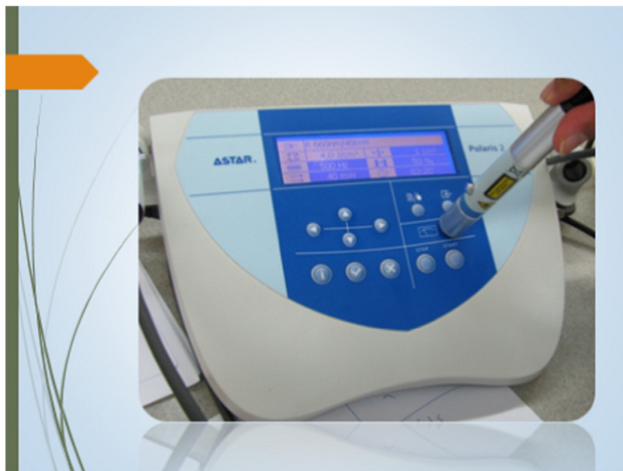
Fig. 1. Diode laser.

The maximum number of CFUs was seen in the control group (mean of 214,200 CFUs with a log value of 5.32) while the minimum values were noted in the laser (808 nm and 100 Hz PRR) plus ICG (mean of