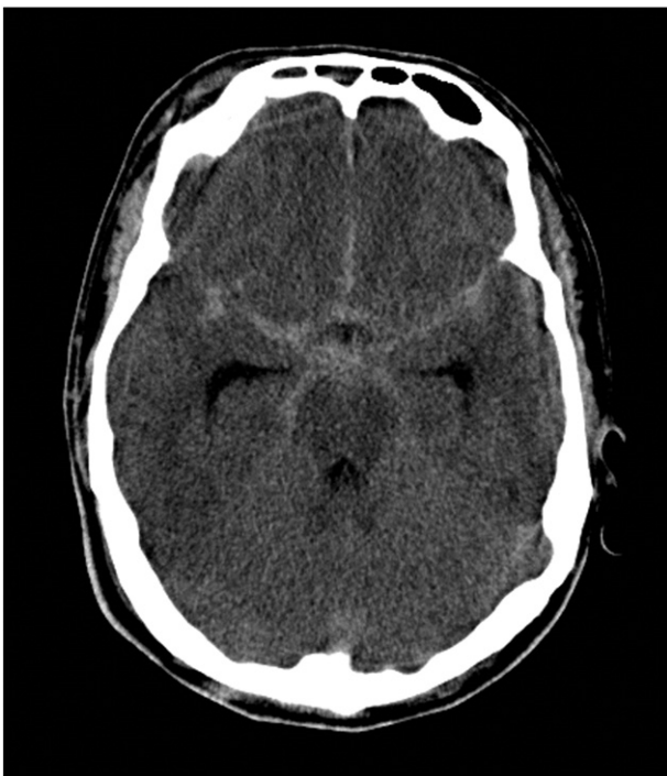
Fig. 1. A diffuse pattern of subarachnoid hemorrhage in the context of trauma. Basal cisterns and Sylvian fissures demonstrate hyperdensity with no cortical hemorrhage. This raises the suspicion for injury to proximal intracranial vasculature.

The natural history of traumatic ICA dissection is not well understood with no level I and very few level II studies examining outcomes of ICA dissection in the setting of known major trauma. If spontaneous (non-traumatic) vertebral and ICA dissections are used as an