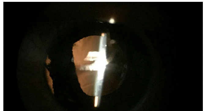
Fig. 2. Case 2: Slit lamp examination revealing iridodialysis extending from 6.30 to 9.30 o'clock.

Supplementary video related to this article can be found at http://dx.doi.org/10.1016/j.ajoc.2016.03.004 .