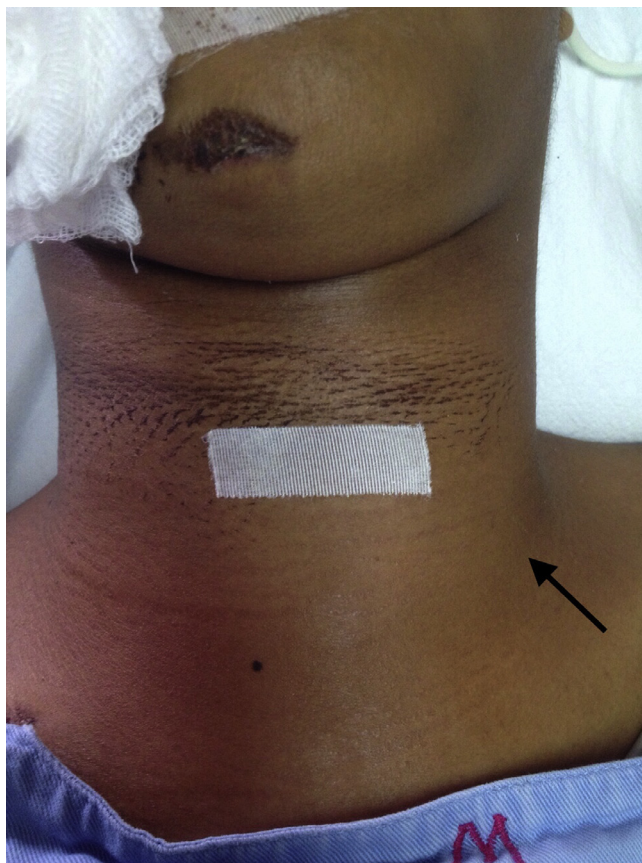
Figure 1 Anterior neck swelling, more obvious on the left side.

The blood investigation results for full blood count and coagulation profile showed normal parameters. Thyroid profile results demonstrated TSH 0.2 mIU/L, free T3 2.5 pmol/L and free T4 20.3 pmol/L, intact PTH 4.1 pmol/L which were all shown within the normal level. He was admitted to intensive care unit and managed conservatively by the multidisciplinary team. The shattered thyroid was managed conservatively by monitoring the NC and colour changes over the neck skin.