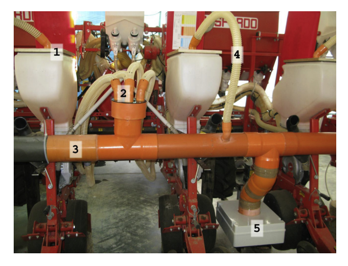
Fig. 1. The drill with the prototype device developed at CRA-ING. (1) airtight gasketed lids replacing the normal lids and provided with pipes (4) channelling the air from the main collector (3) into the hoppers. (2) collector of pipes coming from the drill's fan; (3) main pipe collector. The excess air passes through the box with filter (5) and is directed towards the ground.

The function of the prototype is to maintain the abrasion dust, as much as possible, inside the machine by means of a system that recirculates the normal fan air output. The air deflectors were employed to convey the air into a PVC main collector (diameter 118 mm), serving as a compensation chamber of air pressure. From here, the air flows into the six hoppers, provided with airtight gasketed lids. The air in excess in the system is channelled outwards from the lower side of the main collector, through a box near the soil surface. The box supports an anti-pollen filter with activated carbon (ap/ac filter), used for air filtration in car cabs. After being filtered, the air can exit, at low speed, directed downward. In the process, the air undergoes a slight heating (4-5 \, ^\circ C) . The device is the subject of the international patent application No. PCT/