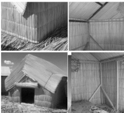
Fig. 1. Uros’s totora house details. Adapted from [6].