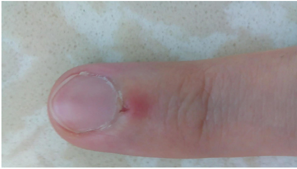
Fig. 1 – Analyzed image of injured human finger. Time elapsed since injury – 60 h.

of the human skin may lead to malignant melanoma. It is the most dangerous type of skin cancer [19-21]. In this paper Authors developed method of recognition of injured (Fig. 1) and healthy human finger (Fig. 2). The advantage of the presented method is analysis of the finger skin using a smartphone.