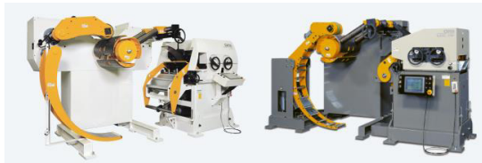
Fig. 1. Coil leveling machine from Oriimec