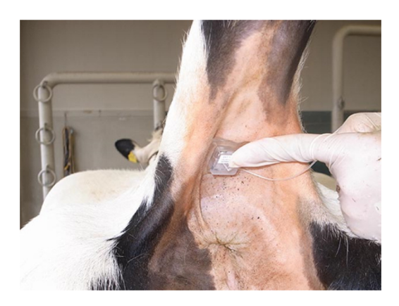
Fig. 3. Position of the wearable wireless sensor attached to the lower surface of the ventral tail base.