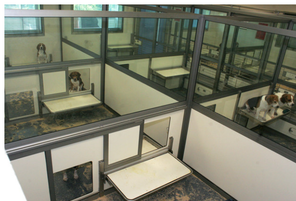
(a) Modern homepen (Groups 1-3,6)

'Welfare' has many uses in common language, but must have an objective definition in scientific use not influenced by moral or ethical considerations ( Broom & Kirkden, 2004 ), and which concentrates on empirical evidence. Welfare can be understood in terms of physical health, and in terms of subjective experience. Broom (1986) describes welfare as a term which describes an individual's state in relation to its attempts to cope with a situation; therefore welfare does not reflect external circumstances but rather how effectively an individual is coping with them and the resulting impact on (evolutionary) fitness. It is well accepted that 'welfare' is a continuum from negative to positive, rather than a desirable condition.