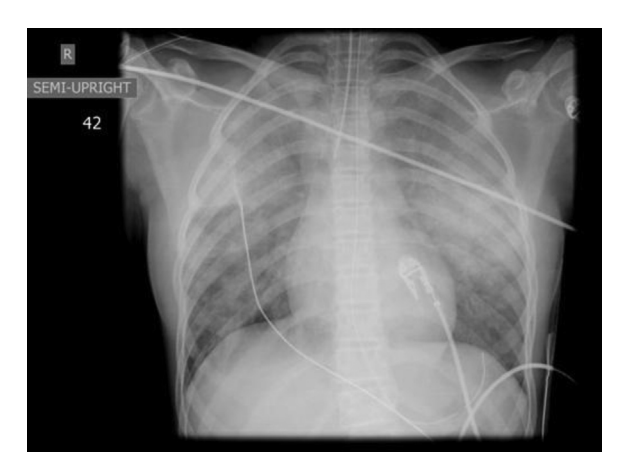
Figure 2. Chest radiograph on admission revealing diffuse bilateral lung opacities consistent with diffuse pulmonary edema.

Initial diagnostic testing for the patient on admission included chest radiograph (Figure 2), the electrocardiogram (ECG) to evaluate her cardiac rhythm, and the echocardiogram. Chest radiograph showed diffuse bilateral lung opacities consistent with pulmonary edema. The initial ECG was consistent with normal sinus rhythm, and the echocardiogram revealed a structurally normal heart with good function although the coronary artery originations were difficult to visualize. On day 2 of her hospitalization, the patient underwent cardiac magnetic resonance imaging (MRI), both with and without contrast to further evaluate cardiac function and revealed an ejection fraction of 67% (normal, 55–70%), normal myocardial wall motion, and no abnormal myocardial perfusion or delayed myocardial enhancement. Unfortunately, artifact from the