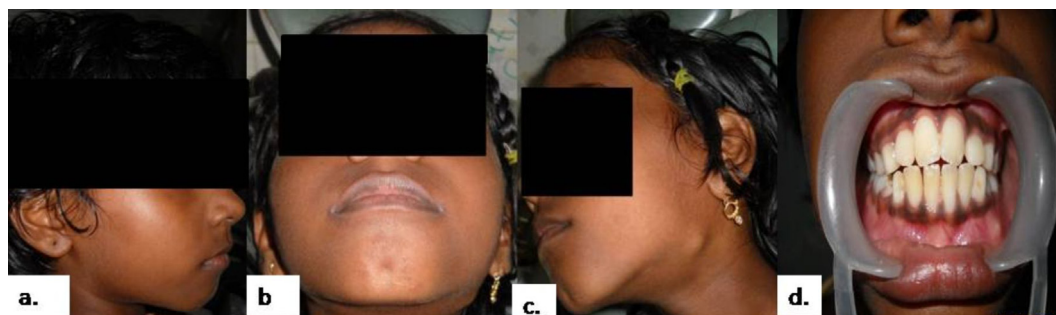
Fig. 1 – (a) shows apparently normal right side of the face. Single, nodular, bony hard and non-tender swelling present at angle of mandible on left side with intact overlying skin (b,c). Intra-orally, there was mixed dentition with dental caries in 74 and 85 (d).

Medical consultation is needed because chondroma can be a part of maffucci syndrome, oller disease or metacondromatosis. In Maffucci syndrome, there will be multiple enchondromas, hemangiomas and lymphangomas will be seen. These enchondromas have more malignant transformation into chondrosarcoma, may cause pathological