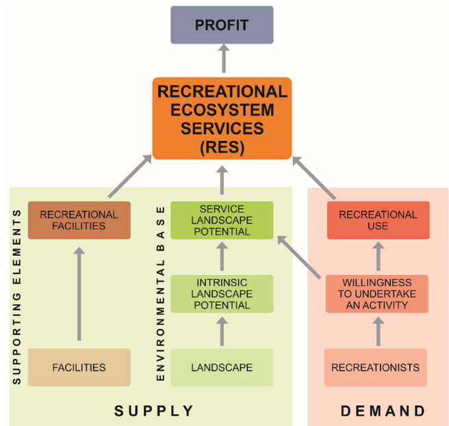
Fig. 1. The RES model.

The context for the RES model (Fig. 1) is the supply and demand framework that is widely used in tourism and ES research (Hall and Page, 2006; Palomo et al., 2013). The supply side includes environmental base, widely considered as crucial for recreation and tourism (Hall and Page, 2006), and supporting elements that determine its use for recreational purposes (Fredman and Tyrväinen, 2010). The demand side includes recreationists and their willingness to undertake nature-based activities. As we focus on the destination, we do not include accessibility to the region. Although it is