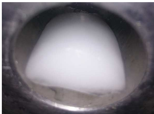
Pure Water (Hard and Dense)