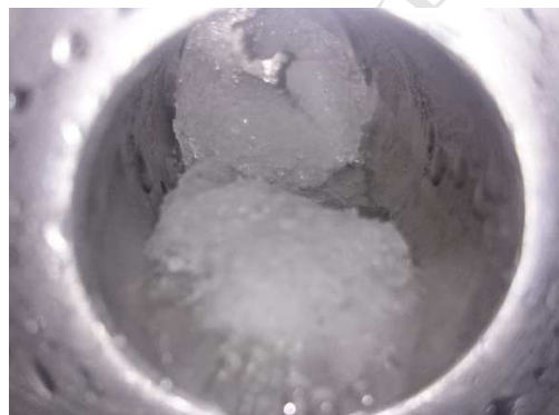
Sodium Chloride Solution (Soft & Porous)