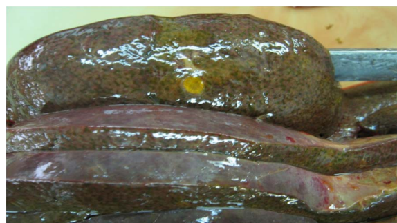
Picture 2. Lungs.

Regarding the tissue samples neither of our methods was positive despite our expectations. Consequently, we designed a novel specific PCR (Table 2) for detection of Saprochaete capitata and S. clavata followed by species identification based on sequencing. After PCR products sequencing we confirmed M. capitatus (Anamorph S. capitata )