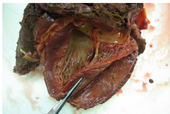
Picture 4. Heart.