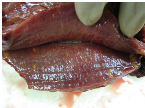
Picture 3. Heart.