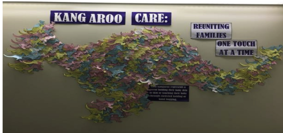
Fig. 1. Kangaroo board at Sunnybrook neonatal unit.