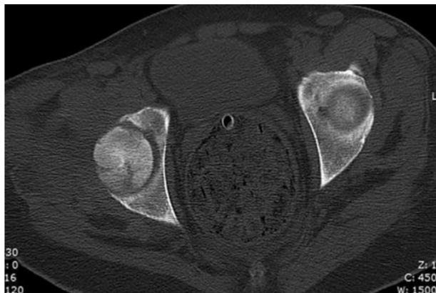
Fig. 1. TC of the right hip showing the necrosis of the femoral head.

During the stay the patient was high feverish (39 °C) and laboratory tests showed persistently high VES, PCR, PCT and leukocytes with neutrophilia.