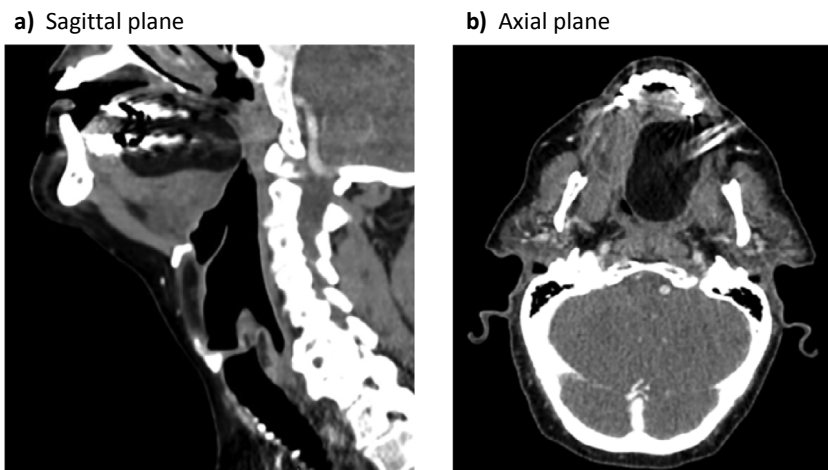
Fig. 2. CT scan of the head and neck showing an oval-shaped mass with distinct margins.

Initially it was decided to keep this benign lesion under review largely because of its asymptomatic nature and the risk of a functional defect and potential surgical morbidity if operated on.