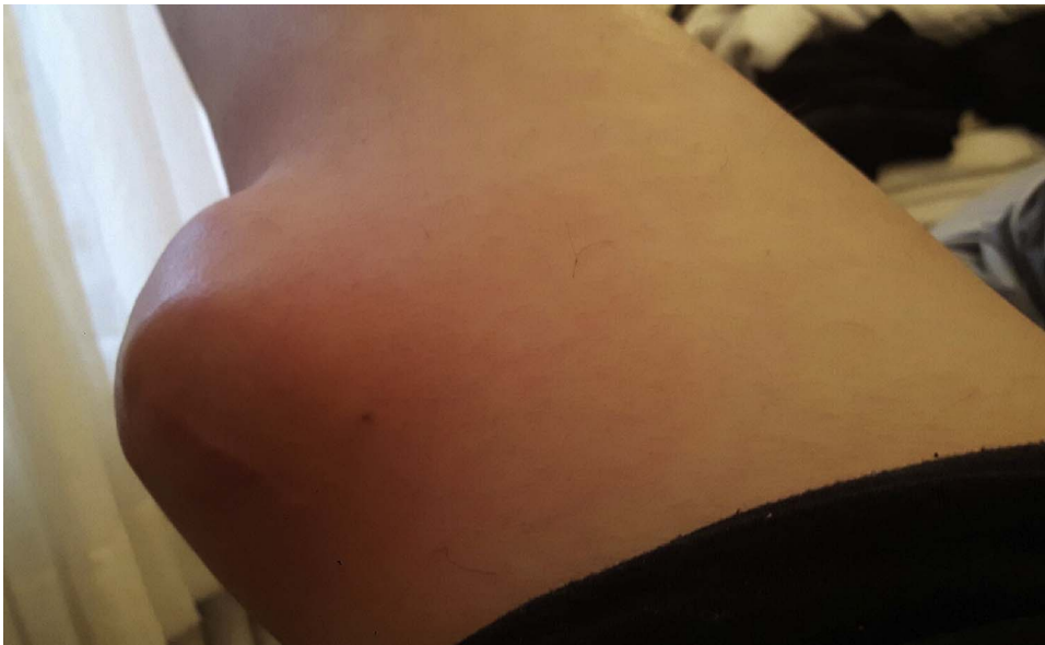
Fig. 1. Large erythematous mass at the lateral aspect of the right thigh.