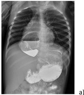
Fig. 2. Posteroanterior barium meal study shows air fluid level at mediastinum on right side and contrast agent seen above the diaphragm.