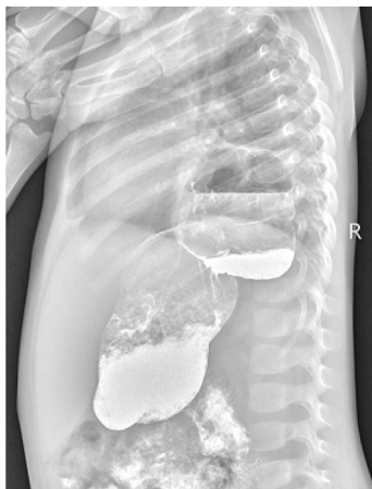
Fig. 3. Lateral barium meal study shows air fluid level at mediastinum on right side and contrast agent seen above the diaphragm.

01 month prior to surgery. Intra-operatively there was 4 cm by 5 cm hiatal defect in which stomach herniated without volvulus and the defect repaired by interrupted stitch. No mesh applied and fundoplication was not done. Hematocrit became 30% after transfusion and reached 40% after 01 month of surgery and anti-ulcer treatment. Anti-ulcer drugs were discontinued after a total 02 months treatment following resolution of epigastric pain, negative occult blood test and normalization of hematocrit. Endoscopy was not done to check healing of ulcer (no pediatric endoscopy). Chest x ray done after 02 month of surgical management showed normal. She had uneventful course after management and discharged from follow up after 6 month of surgical management (see Fig. 3).