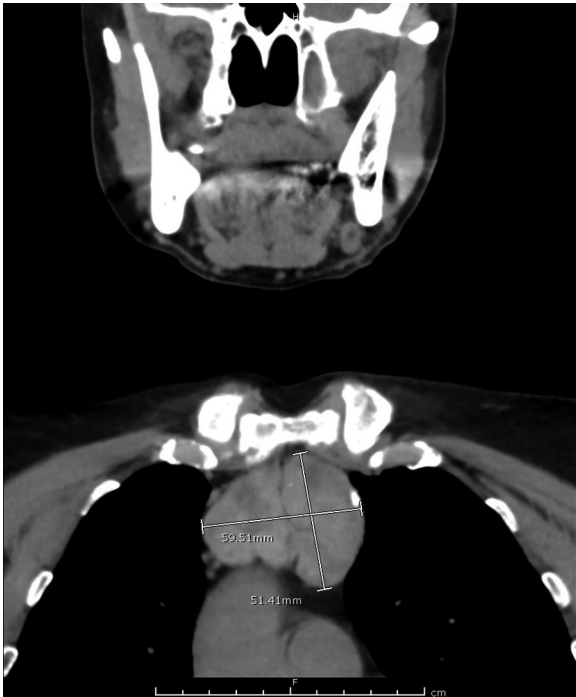
Fig. 1. Non-contrast computer tomography (CT) scan with coronal views of the 5 × 6 cm anterior mediastinal mass, above the aortic arch.