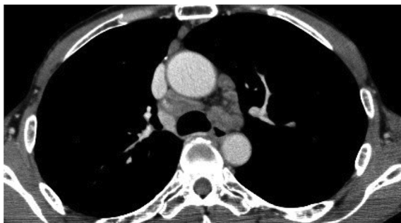
Fig. 1. Computed tomography before endobronchial ultrasound-guided transbronchial needle aspiration. Enlarged mediastinal lymph nodes with calcification were observed.

CT on day 28 revealed a shrinkage of the hypodense region in the lymph node and the patient was discharged on day 34 (Fig. 2).