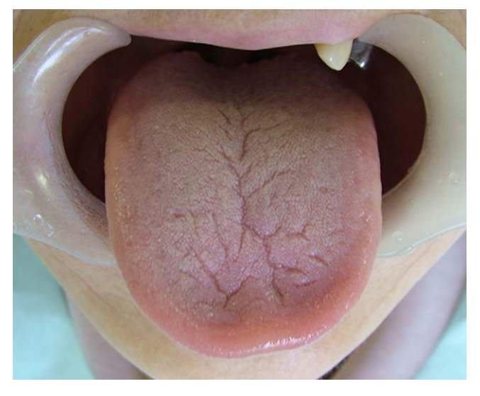
Fig. 2. Glossitis due to candidiasis (before treatment)—the entire surface of the tongue was smooth.