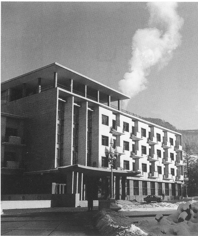
Fig. 1. Gong Deshun/The Beijing Industrial Design Institute, the Bogd Khan Mountain Hotel, 1959, Ulan Bator, Mongolia.

Although the discourse characterising Beijing's architectural field in the 1950s was national in form and socialist in content (socialist realism), and the application of abstract formal languages was constrained profoundly by conservative ideologies, architectural aid nevertheless provided a rare opportunity for Chinese architects to explore modernist architecture in a different context. As the architectural historian Zou Denong noted, compared with the domestic sophisticated circumstance, the lowered limits of aid allowed architects to experiment with a critical modernist approach (Zou, 2001). Among the architecture exported during Mao's time, a comparable project that demonstrated Chinese architects' skill at integrating modern vocabularies with local