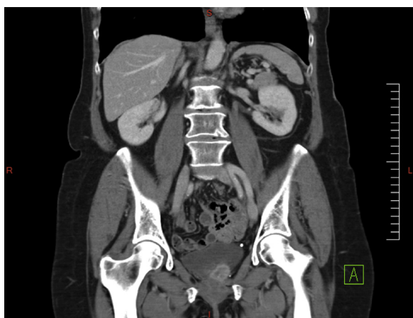
Figure 1 Mass of the left-postero lateral wall of the bladder on CT-scan.

We report a case of a woman of 74 affected by a malignant PEComa of the bladder which was successfully treated by radical cystectomy.