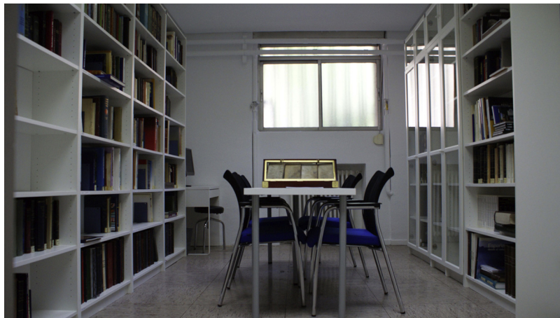
Figure 1 The Professor García Pérez Library of the Spanish Academy of Dermatology and Venereology (AEDV), in its current location in the Olavide Museum, Faculty of Medicine, Universidad Complutense de Madrid.