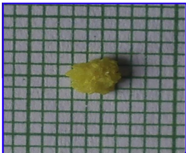
Fig. 1. Photograph of as-grown BMBC crystal.

FT-IR and FT-Raman spectra of BMBC recorded using AVATAR 330 FT-IR by KBr pellet technique and BRUKER RFS 100/S Instrument are shown in Fig. 2. The absorption bands at \sim 1601\text{ cm}^{-1} in FT-IR and 1596\text{ cm}^{-1} in FT-Raman are aromatic C=C stretching frequencies of BMBC. The absorption bands