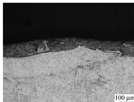
Fig. 2. Optical micrograph of the laser alloying layer.

Fig. 3 shows the XRD patterns of phases in the CrNiMo stainless steel and the laser-alloyed layer. The CrNiMo stainless steel substrate is mainly composed of FeNi and FeCr solid solution (as shown in Fig. 3(a)). After the laser alloying treatment, fine WC powder dissolves into the melt pool, and then solidifies to form different types of metal carbides and tungsten carbides such as W 2 C, Ni 4 W, MoNi 4 , Fe 6 W 6 C, et al. (as shown in Fig. 3(b)).