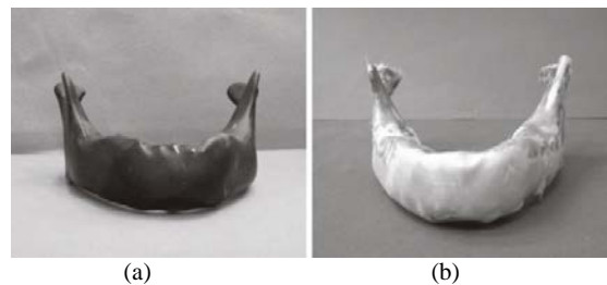
Fig. 2. Images of 3D customized polymeric (a) and composite models (b).

For the design of the mandible model, trabecular bone was replicated with an acrylic resin that has a Young's modulus of 2.0 GPa (Figure 2) and this value is close to that measured for trabecular bone (2.2 GPa) in the mandible symphysis and along the bucco-lingual direction [49]. The next step was to subject the human mandible on load-displacement tests as shown in Figure 3.