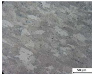
Fig. 1. Microstructure of BM.

The FSP experiment procedure is illustrated in Fig. 3. The rotating FSP tool was plunged into the AA5083-H111 sheet until the shoulder contacted the top surface of the plate; the tool was then traversed along the sheet surface. The material around the tool became softened and highly plasticized from the frictional heat generated during the process and was carried around the tool. In this study, the tool was rotated in clockwise direction with a constant tilt angle (defined as the angle between spindle and workpiece normal) of 3^\circ , which assisted