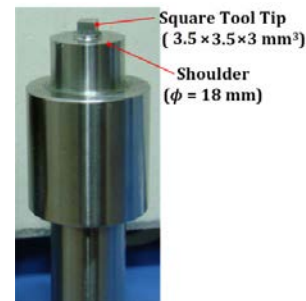
Fig. 2. FSP tool used in the experiment.

the forging action at the trailing edge of the shoulder. The tool rotational speed was varied from 600 to 1000 rpm, while its traverse speed was kept fixed at 50 mm/min. The FSP experiments were carried out at room temperature and each experimental condition was repeated three times to assure the repeatability.