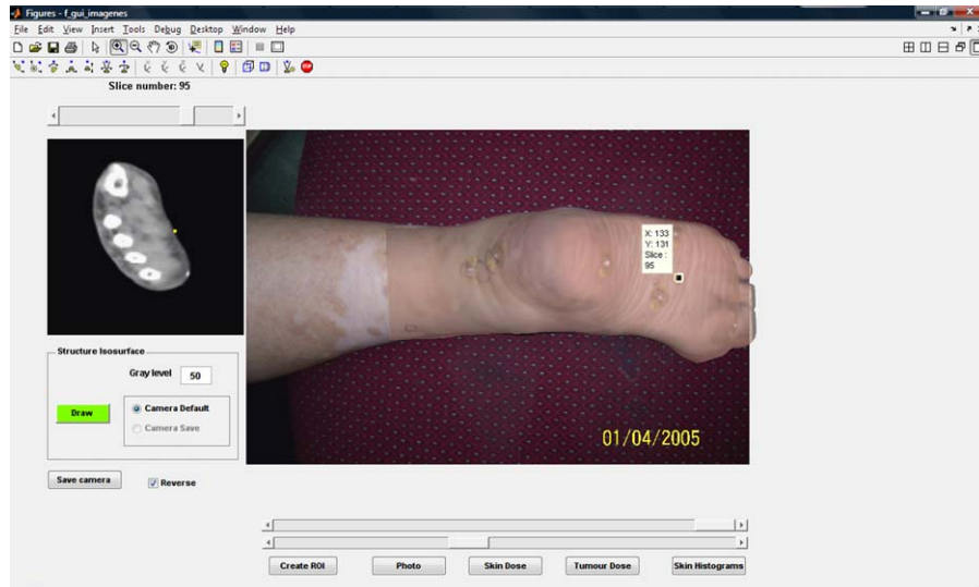
Fig. 2. Registration of the 3D reconstruction and the corresponding picture of the patient's anatomy.

treatment planning purposes. Reference marks appear both in the TAC images and in the photograph of the anatomy (see Fig. 1).