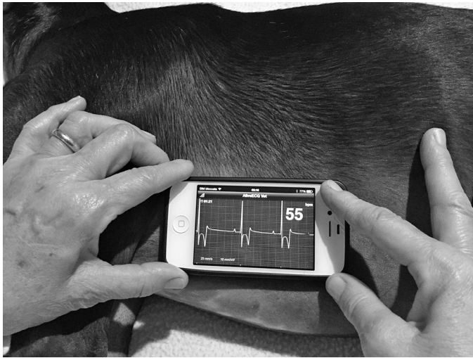
Fig. 1. Cranio-caudal orientation of the smartphone in a dog. The camera side of the smartphone was located caudally.

right lateral recumbency. Surface electrodes made of flattened alligator clips were attached to the skin at the level of the olecranon on the caudal aspect of the forelimb, and over the patellar ligaments on the cranial aspect of the hind limbs (Tilley, 1992). Rubbing alcohol was applied to maintain electrical contact with the skin. A sampling frequency of 1000 Hz for standard ECG acquisition was used, with a 100 Hz low-pass filter and a 0.3–0.5 Hz high-pass filter to decrease respiratory artefact (Hinrichliff et al., 1997).