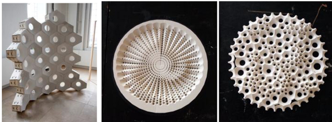
Fig. 2. The full scale prototype wall (left) and 3D printed test panels at 1:10 (right) from Responsive Acoustic Surfaces at Smart geometry 2011.

Fundamental to architectural projects is a requirement for the clear and consistent flow of information in a 'downstream' direction. This follows a chronological project sequence from early design proposals,