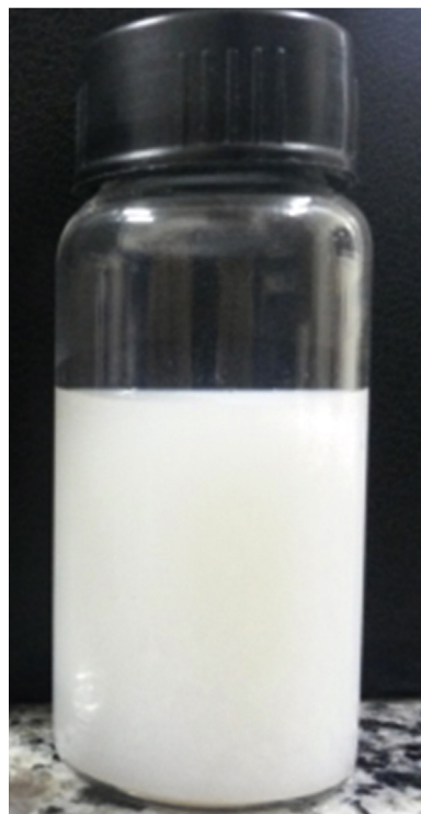
Fig. 1. O/W nanoemulsion of Rosmarinus officinalis .

Nanoemulsion containing 5% (w/w) of essential oil from R. officinalis , 5% (w/w) of polysorbate 20 presented a fine appearance and