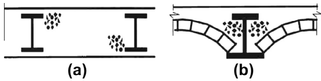
Fig. 1. Typical (a) "Filler joist" and (b) "Arch jack" floor [1].

and this is the overall aim of this paper. Specifically, this research will investigate the sensitivity of the fire resistance performance of the metal beams to variations in the following relevant material properties: