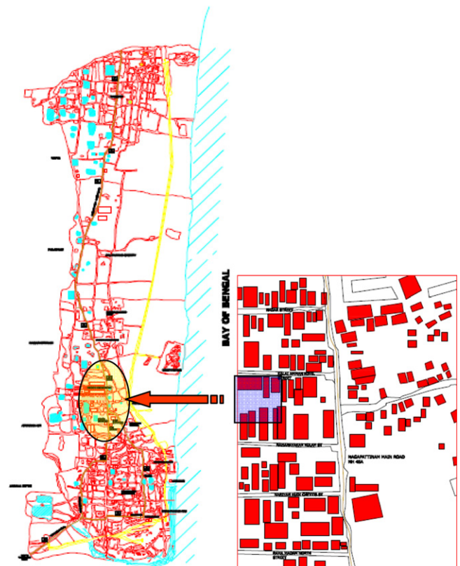
Fig. 2. Delineating the study area showing the base map of Nagapattinam.

The presence of high amount of moisture in the atmosphere for major part of the year causes thermal discomfort as there is less evaporation, resulting in sweating. The monthly normal climate of Nagapattinam is given in Table 1. Temperature vary from 21^{\circ}\text{C} to 41^{\circ}\text{C} (Fig. 4), relative humidity (RH) varies from 60% and will be