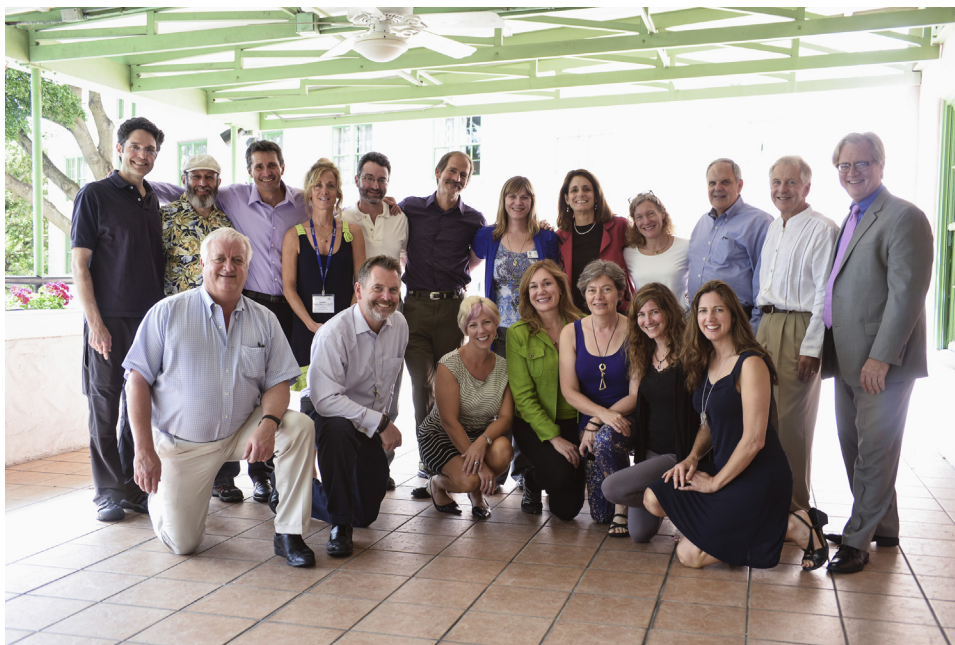
ABIHM and AHMA Leaders come together to discuss future of Academy of Health and Medicine

eyes and minds of countless healthcare professionals to the importance of herbal medicines in healing, eco-conservation, traditional use, and even economics,” said Aviva Romm, MD.