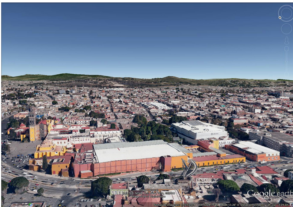
Figure 1 Paseo de San Francisco area and the Art Gallery, Puebla, Mexico.