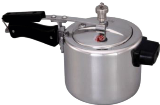
Fig. 2 – Pressure cooker with pressure regulating valve on the top.

The MRI of brain (Fig. 4a, b) shows about 4 × 3 × 4 cm of size, ring enhancing lesion at left basifrontal region with perilesional edema and mass effect suggestive of intraparenchymal abscess. Total excision of abscess was done. Postoperative period are uneventful and patients improved symptomatically with no neurological deficit.