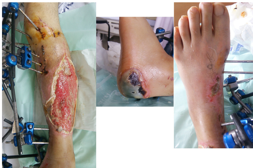
Figure 1. The wound of the right lower limb at admission. The wound caused by the fasciotomy on the outer side of the lower leg was open with a large amount of necrosed tissue and the bone and tendon were partially exposed. Ulcers also developed at the heel and the dorsum due to compression by casting and casting was discontinued and several external fixation pins were placed to prevent foot drop.

penetration wire (Wizard 3, Japan lifeline, Japan), the lesion was crossed. IVUS findings revealed proximal occlusion site of the peroneal artery with a smaller diameter and suggested negative remodeling. The vessel wall showed complete loss of triple-layer structure of vessels overlapping with the fractured area of the tibio-peroneal trunk (Fig. 3). Because the tissue was likely to be very fragile, angiography was performed with the IVUS catheter placement, which