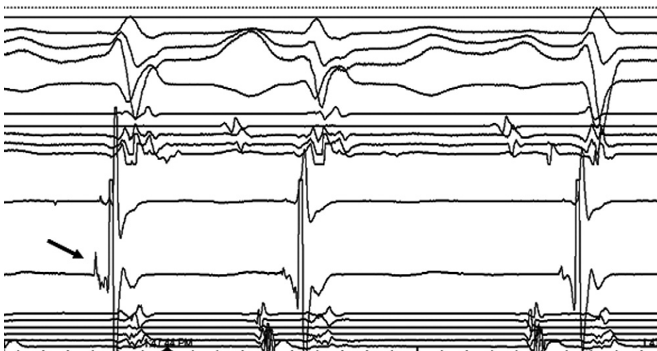
Figure 2 Purkinje potential (arrow) preceding a typical premature ventricular contraction that triggered ventricular fibrillation.

The primary mechanisms of SCD are VF and polymorphic ventricular tachycardia. These arrhythmias may occur in the absence of structural heart disease. In the patient described in this report, the lack of abnormality on ECG, echocardiogram, coronary angiogram, and coronary endothelial function study raised the probability of idiopathic VF. The patient's sentinel event of resuscitated SCD at age 39 years with documented polymorphic ventricular tachycardia and rate-corrected QT interval of 450 ms resulted in a presumptive diagnosis of LQTS and placement of an ICD. Multiple ECGs, including those recorded during treadmill testing and ambulatory monitoring, showed normal QT intervals; nevertheless, a