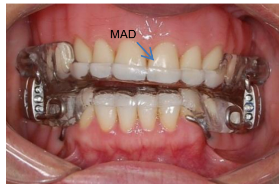
Fig. 2 – Patient with dentures and MAD installed.

Treatment of edentulous patients with mild OSA is normally limited to CPAP or tongue retainers, which have low compliance [5,11]. The prevalence of OSA increases with age [2], and the prevalence of edentulous individuals is also high in the elderly population [8]. Using a MAD on a prosthesis is an alternative, as it is a low-cost treatment and does not require a power source [4].