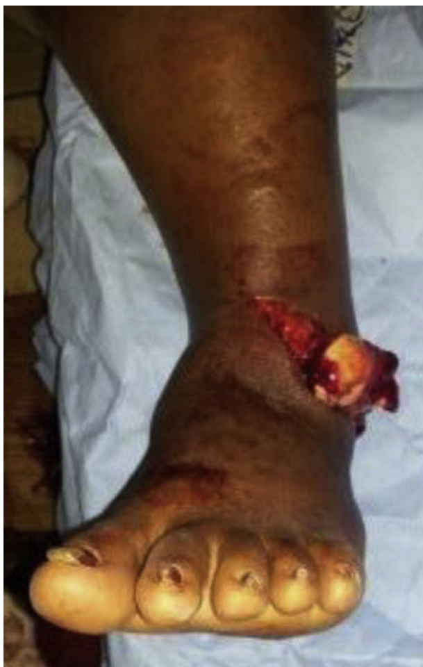
Fig. 1 – Photograph showing the dislocated talus with the open lateral anterior ankle wound.

Upon admission, the patient was given injectable cefazolin and gentamicin and received a tetanus immune globulin. In the ER, the wound and the dislocated talus were irrigated with normal saline solution and cleansed with povidone