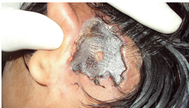
Figure 1. A 4 cm × 5 cm tender violaceous and necrotic lesion over the left postauricular area with formation of an eschar, suggestive of ecthyma gangrenosum.

was conscious, in immense abdominal pain, had gallop rhythm (heart rate 160/min), normal systemic oxygenation (on room air) and a blood pressure of 90/70 mmHg. She had multiple ecchymotic lesions with violaceous hue over the arms, trunk and back; several vesicular lesions over the arms and back, a 3 cm × 3 cm violaceous lesion over the dorsum of the left foot, which appeared after admission, eventually evolving into a necrotic patch, and a 4 cm × 5 cm tender violaceous and necrotic lesion over the left postauricular area with formation of an eschar, suggestive of ecthyma gangrenosum (Fig. 1). She had guarding and tenderness over the abdomen, with a soft, tender liver palpable 6 cm below the right costal margin (span 11 cm). The spleen was just palpable.