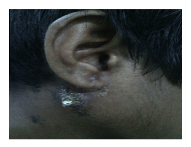
Figure 1 Swelling in the right parotid region with some local application over it.

Through physical examination excluded clubbing, cyanosis, dilated veins, pedal oedema, organomegaly and lymphadenopathy. Examinations of other systems were normal including respiratory system with normal chest skiagram PA view. Laboratory investigations revealed no abnormality except raised ESR (140 mm in first hour). Routine blood tests, including sugar (fasting), renal and liver function tests, urine analysis, ECG and Ultra-sonography (USG) of the abdomen showed no abnormality. HIV serology was also negative. Monteux test was positive with induration of 20 \times 20 cm in 48 h. The sputum smear examination was negative for acid fast bacilli (AFB). No calcification was found in sialogram of the parotid gland. Anti-Nuclear Antibody, Rheumatoid Factor and Anti-ds DNA were negative and serum ACE titre was normal, further excluding the possibility of sarcoidosis and other autoimmune disorders.