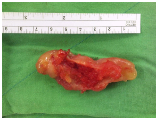
Fig. 2. A brown to red-brown gelatinous mass, 7.5 × 3 × 1.5 cm, retrieved from the abdominal aorta.

Intraoperative transesophageal echocardiography showed a stalk in the left atrium (Fig. 3). Microscopic examination, including immunohistochemistry for DC34, confirmed that the mass was a cardiac myxoma several days later (Fig. 4). The surgical field was assessed meticulously for hemostasis and the splenic hilum was examined via a small incision of peritoneum for any laceration injury from traction, then the wound was closed in layers without tension. One Jackson-Pratt drain was placed in the splenic bed via the peritoneal incision and another chest tube in the pleural cavity. Fasciotomy was not