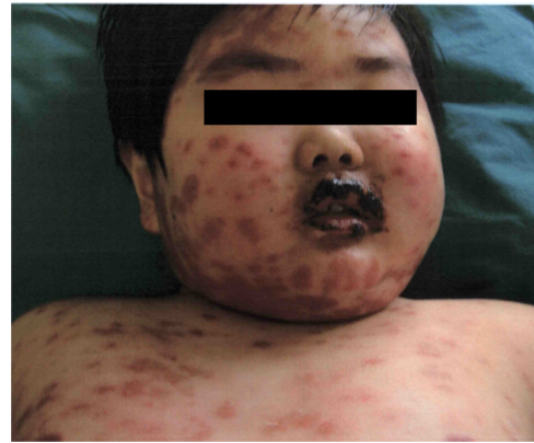
Figure 2. Erosions and crusts on the lips and multiple bullae on the face and chest.

TEN is a rare but life-threatening disease that involves the skin and mucosa, and is usually caused by certain drugs [1].