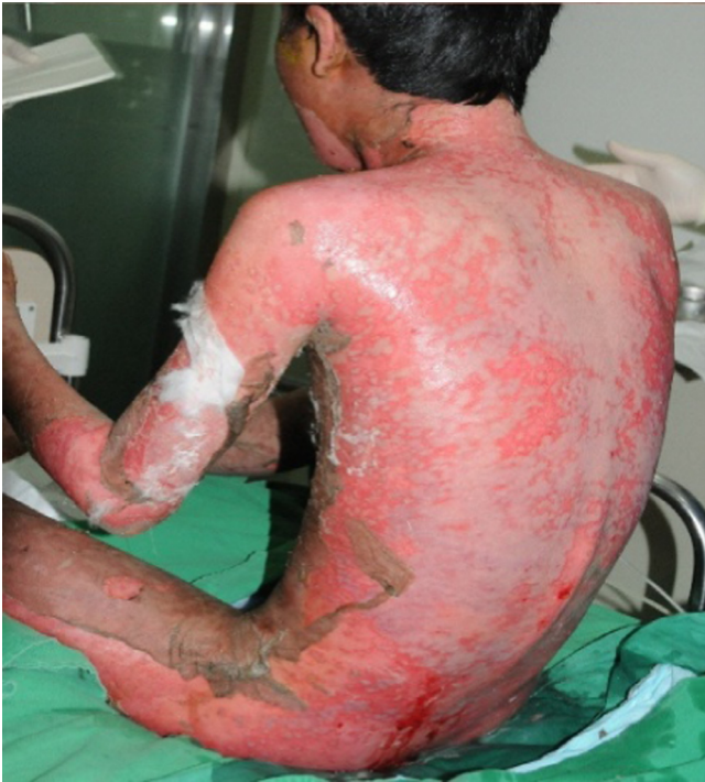
Figure 1. Typical pattern of toxic epidermal necrolysis: erythema, blistering, and full-thickness epidermal loss is seen over the entire body.

discontinued immediately. Intravenous immunoglobulin-G (IV-IG; total, 4.51 g/kg) was administered according to the severity of the skin lesions. After 18 days of treatment, the skin lesions improved. The patient needed conservative management, and was discharged on hospital Day 25. After discharge, the NS has been controlled by switching the treatment to PD, and the patient has consistently taken risperidone. Thus far, he has not experienced any skin complications.