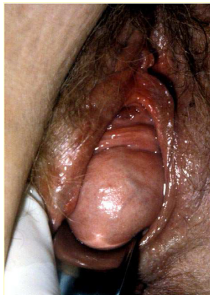
Figure 3 Is this a small cystocele, moderate cystocele, first degree cystocele, second degree cystocele, third degree cystocele or a stage III anterior wall prolapse?

Currently there is no adequate definition of prolapse. IUGA & ICS published a joint report on terminology for female pelvic floor dysfunction in 2009. It described prolapse as a departure from