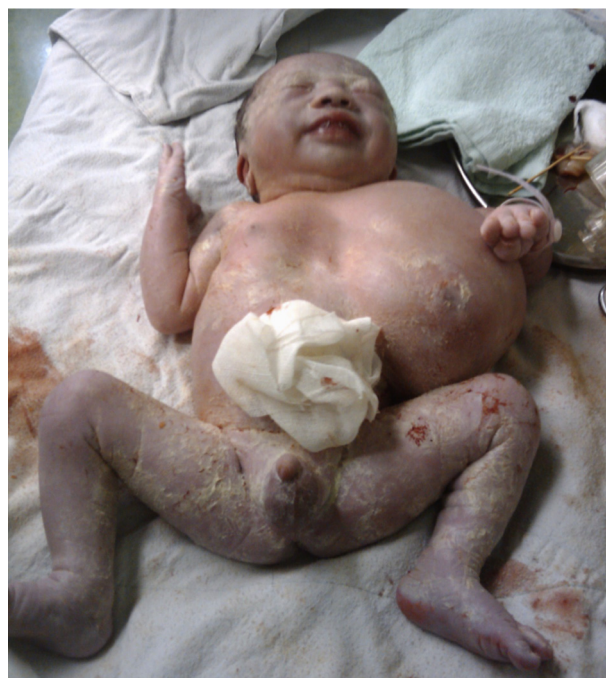
Fig. 2. Images of infant at birth. Image of infant at birth, showing a 14 cm × 9 cm × 9 cm soft cystic mass in the left anterior chest wall area, and extended to left upper arm.

The mother's postoperative course was uncomplicated and she was discharged 5 days after the cesarean delivery. At 4 days of age, the infant underwent surgical removal of the giant cystic mass. Pediatric surgeons found the cystic mass (14 cm × 9 cm × 9 cm) covered the left anterior and lateral chest; the cystic mass extended to the left axilla, which enclosed the left branchial plexus and connected with another mass on the left upper arm